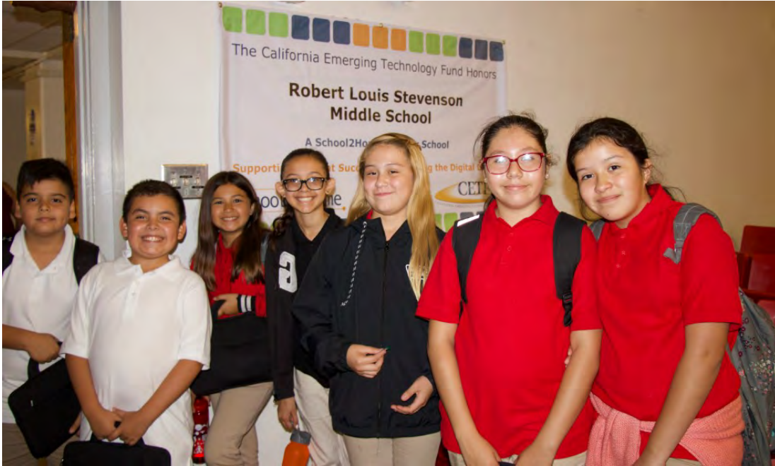
Students at Robert Louis Stevenson Middle School in East Los Angeles are excited to be getting computers for home use and access to discount Internet services.