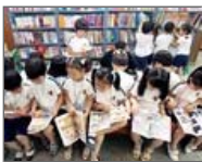
Exchange of ideas