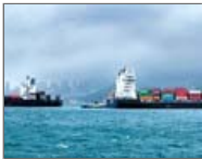
Light trip home