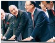
Making an impress...