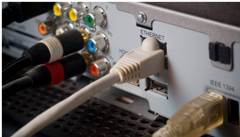
Bringing internet capability to communities throughout the San Joaquin Valley is the focus of a new effort.